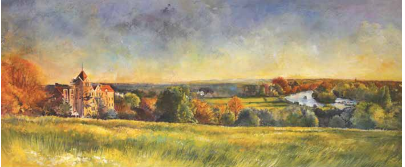
Star and Garter Hotel