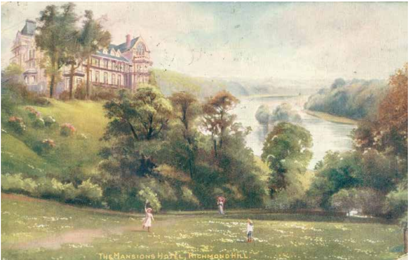
The Mansion Hotel, Richmond Hill

An examination of two sales brochures for the auction of The Mansion Hotel revealed that the dimensions of the restaurant would have enabled 70 persons to dine which was approximately the number of attendees at the Consecration Meeting. The conclusion therefore, although no definitive records exist, is that the restaurant within the New Star and Garter Hotel was named The Tudor Restaurant.