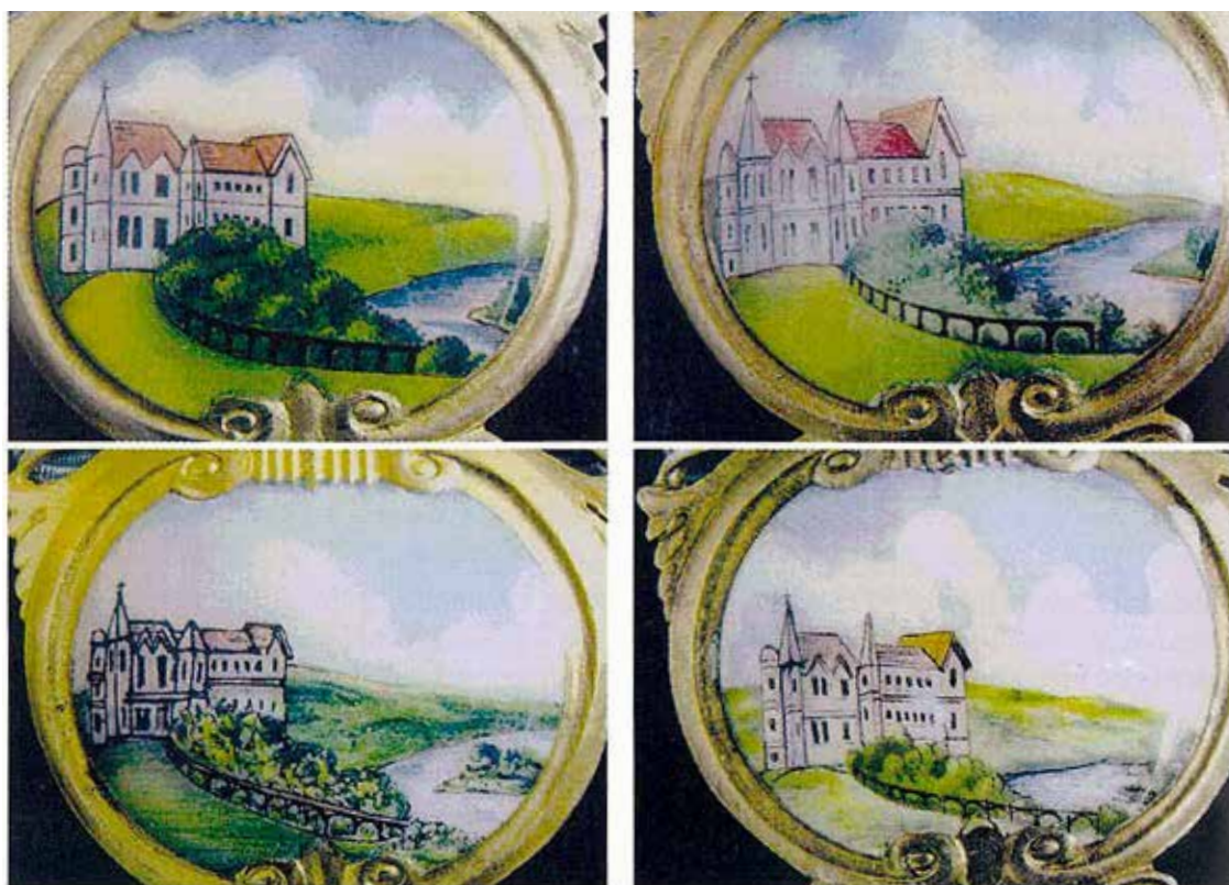
Four Past Masters' breast jewels, showing various artists' interpretations of the New Star and Garter Hotel