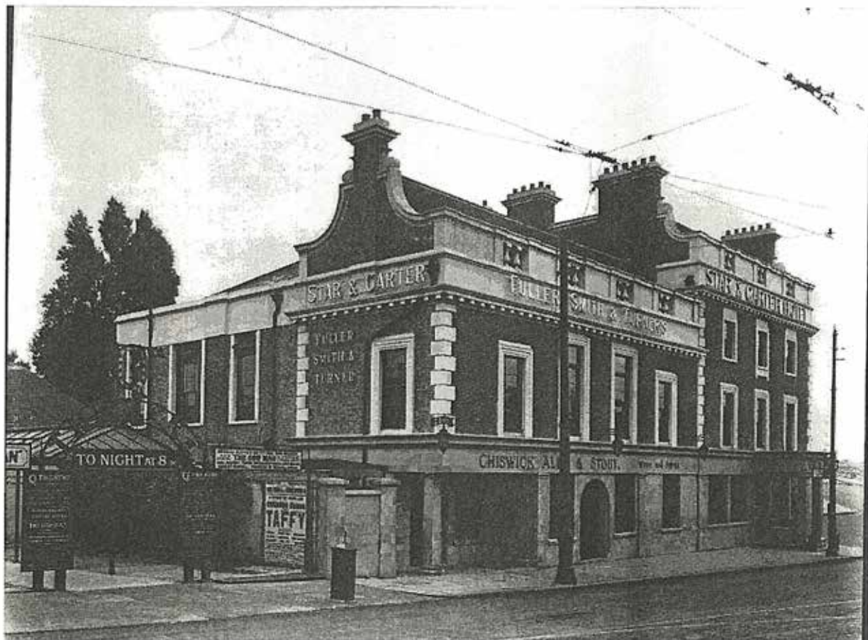
The Star & Garter Hotel, Kew - our third meeting place.

A letter from the management of the Greyhound Hotel was discussed at some length at a Committee meeting on 30th August 1955. This stated that, due to structural alterations, whilst a room could be made available for meetings, the dining facility would no longer be possible. A small committee was formed to investigate other possible new arrangements which later reported that the Star and Garter Hotel at Kew Bridge had been viewed and the opinion was that this was a suitable meeting place. Some changes would have to be made to the meeting dates in November and in April and there was a problem of storage space which meant that the 3 chairs, 3 pedestals, organ and carpet could not be stored. However, these could be hired from the Royal Alfred Lodge, No 970. It was proposed that the Lodge transfer to the Star and Garter Hotel.