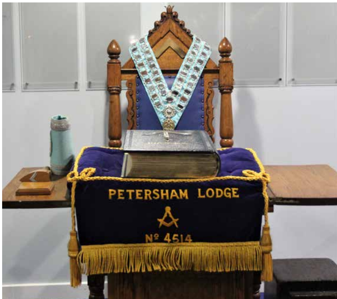
Masters Chair and Collar