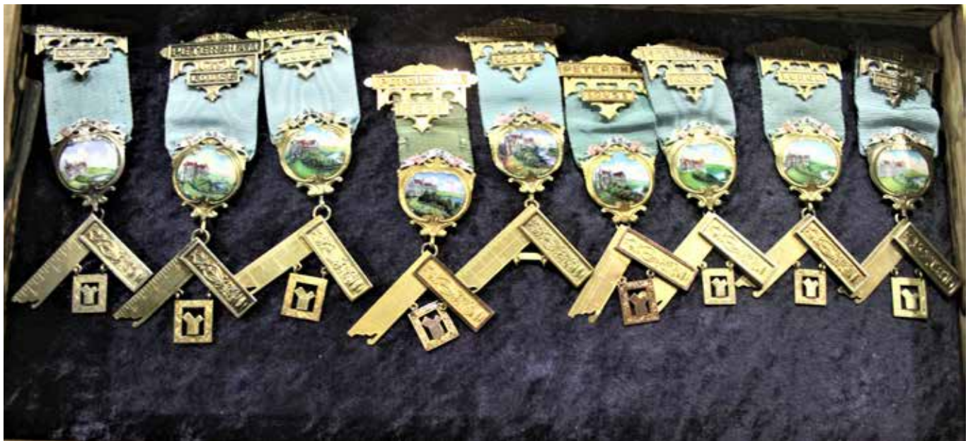
Past Masters' Jewels