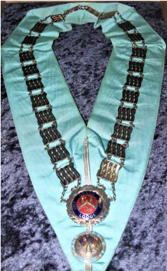
Original Masters Collar