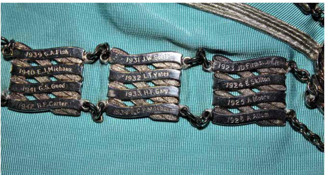
Original Masters Collar with First Worshipful Masters' Names