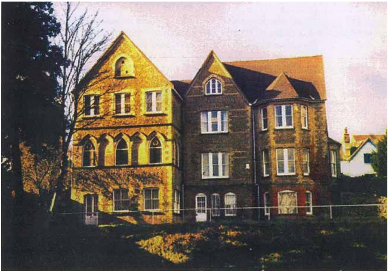
Weybourne House, Guildford